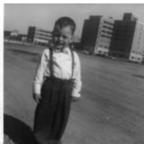
Here's a picture of me taken here in Columbia, MO over 40 years ago.

(Editor's Note: We'll pick up with the year 1872 and finish the notes in the next issue. We will also start listing the names of those baptized by year as listed in the notes.)